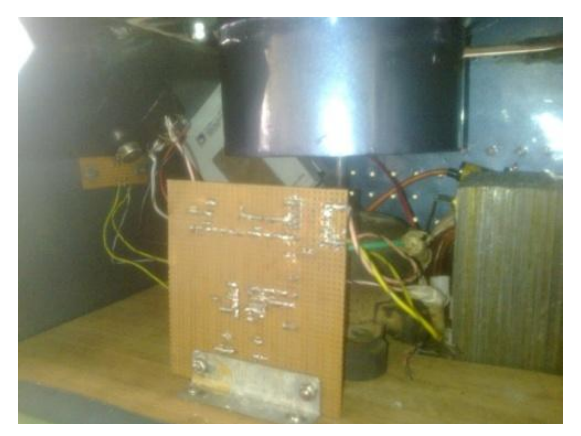
Fig. 5 Component assembly