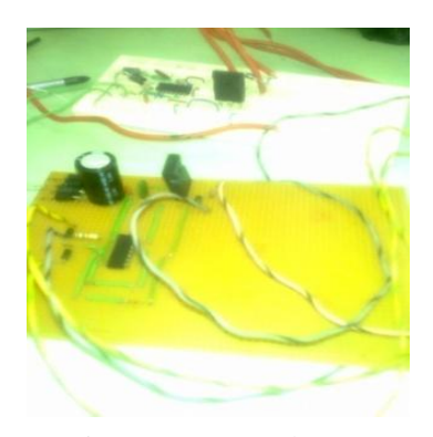
Fig. 3 Component layout

The circuits, DC power supply and the PWM motor speed controller were constructed by mounting the components on a bread board (test board) as one circuit to confirm proper workability. After confirmation, the components are then transferred to a vero board and soldering is done to obtain firm positioning and electrical contacts. The component layout is shown in Fig. 3.