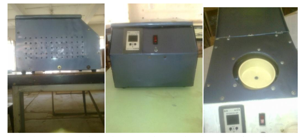
Fig. 4 Structure of the spin coater casing, (a) Side view and (b) front view