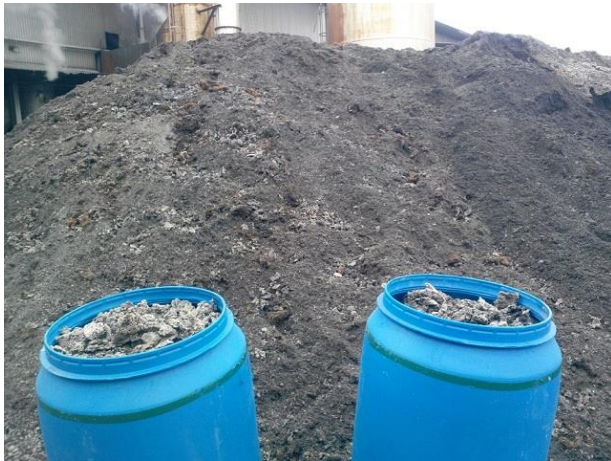
Fig. 2 Storage of palm oil clinker (POC)