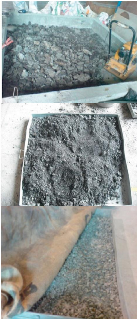
Fig. 4 A process flow of POC aggregate