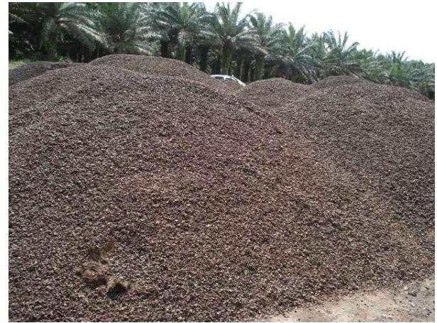
Fig. 1 Mass storage of oil palm shell (OPS)

3. Low-density or insulation concrete (ASTM C 332-87): The usual density of this concrete is between 300 to 800 kg/m 3 and 28-day compressive strength should be in-between 0.7 to 17 MPa. Furthermore, thermal conductivity